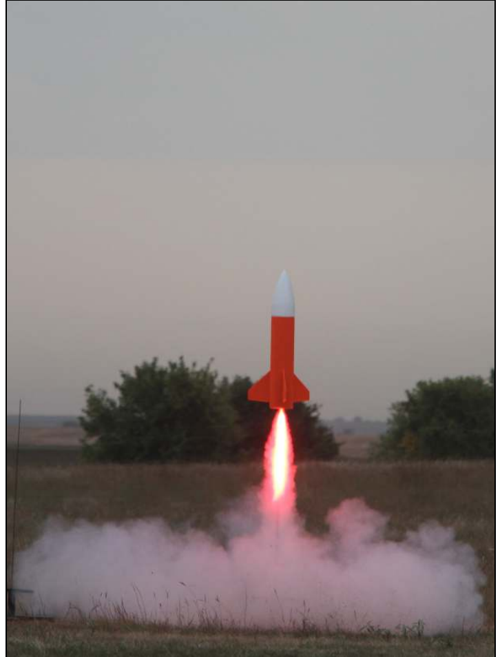
Beautiful lift-off on an Aerotech Red motor on Dave Pomeroy's KloudBuster rocket.