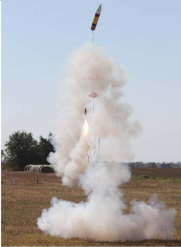
That's not supposed to happen!!!