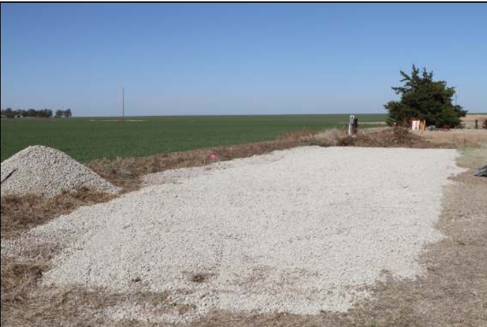
Rock pad prepared for placement of containers..