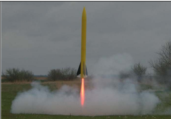
Grand Illusion takes-off under M1250 Polish Rojo power during a great April TRx launch weekend.