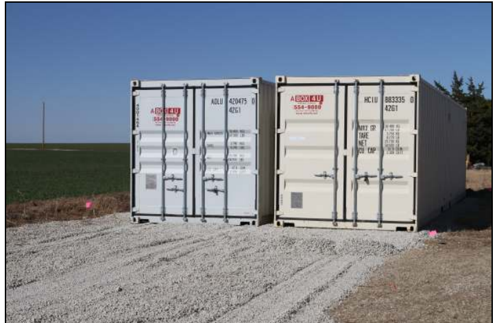
Two 40'X8'X8' containers where the old 53' semi-trailer used to sit.