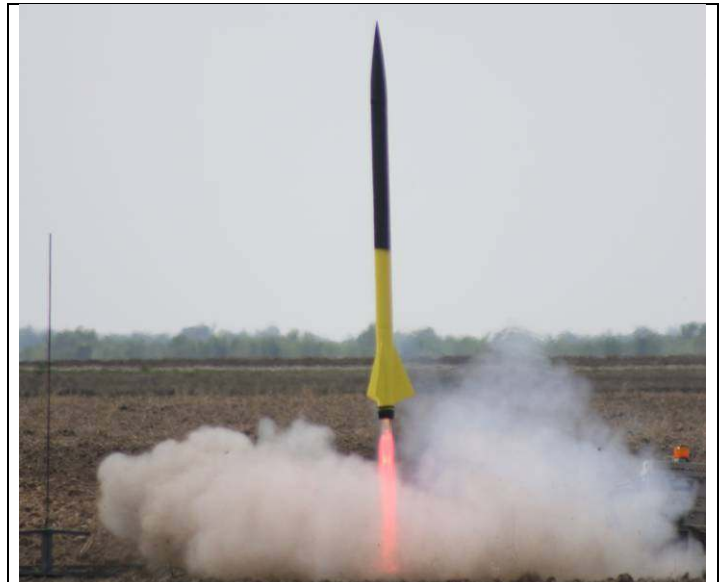
Polish Rojo M1200 in C4.2 headed toward 13,700'.