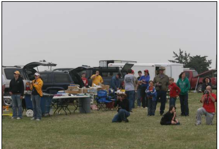
Attentive rocketry lovers watch the proceedings at KloudBurst 20.