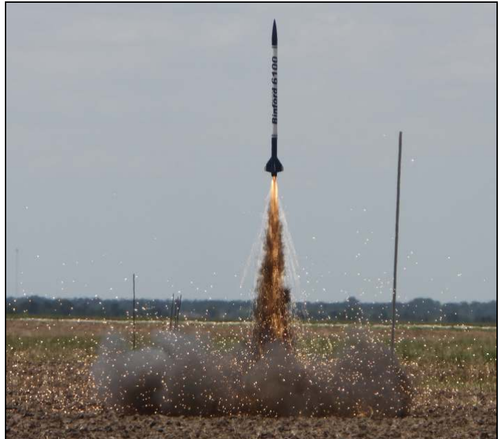
CAUTION: Emits Showers of Sparks.