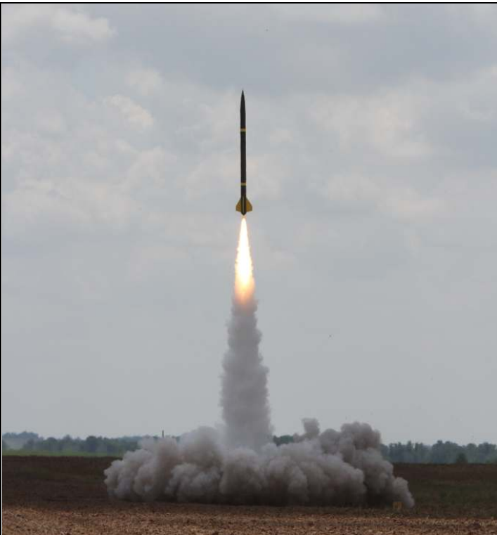
Justin Nichols Level 3 launch at SB2.