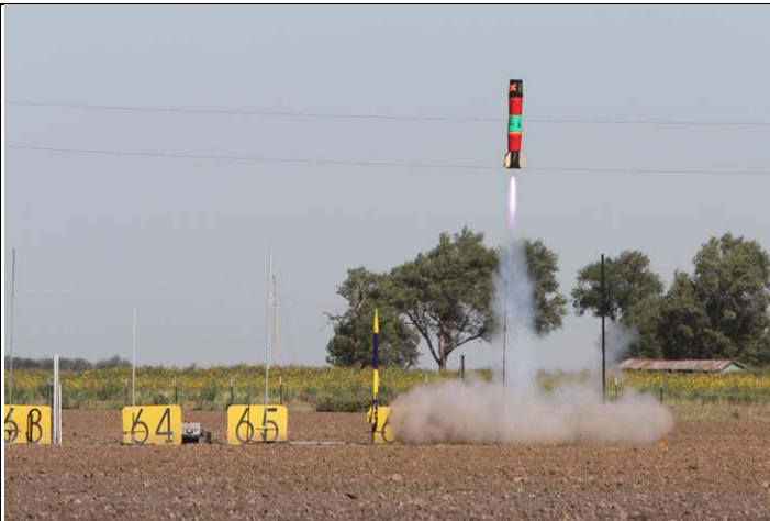
Now this gives a whole new meaning to "Bucket List" ...