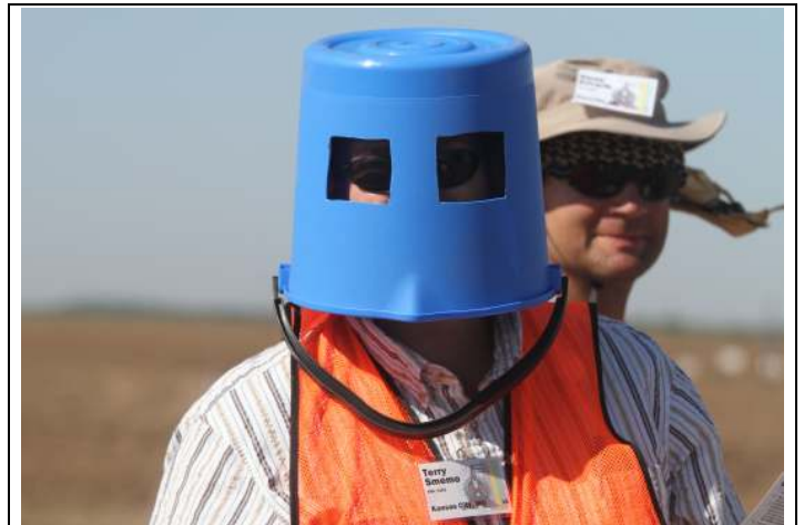
... As does this ...