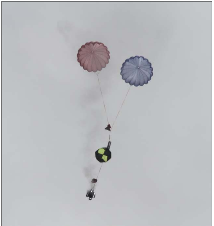
Impressive recovery of Marty Beck's "Kraken Up" upscale Kraken Level 3 launch.